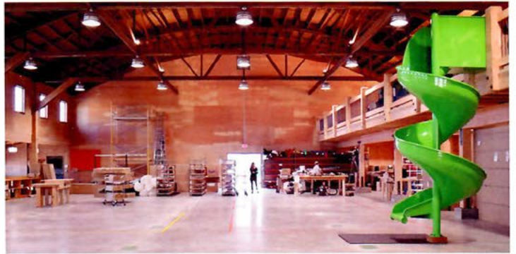
Opposite page: Finished exterior of the Softstar Shoes Workshop, historic image of locals at skating rink. This page, top: before image of the exterior, finished interior. Right: interior under construction with green slide.