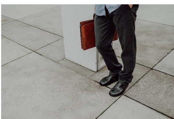
Caption 2: Handcrafted in USA